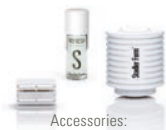
Accessories: Water Cube™, Anticalc Cartridge (optional) and Essential oils

Weight: 5.1 kg / Sound level: 27 – 48 dB(A)